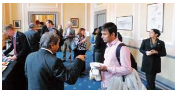
Networking Cocktail at Zero Carbon Energy – The Future, Edinburgh

The workshop was co-organised with the European Parliament Intergroup on Climate Change, Biodiversity and Sustainable Development and brought together European policy-makers, the chemical sector, the academic world and civil society in order to discuss the opportunities of turning waste into fuels, basic chemicals, polymers, and even fine chemicals and pharmaceuticals. More on this workshop can be found at http://www.euchems.eu/?p=667 .