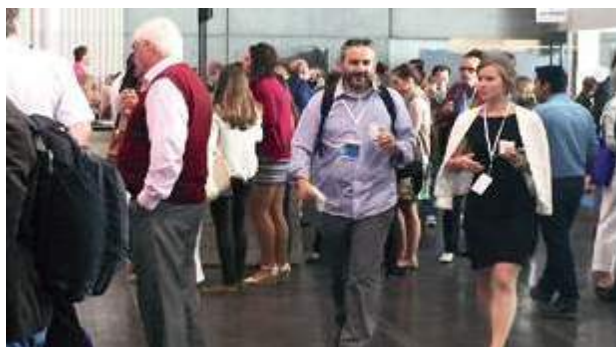
18 th EuroAnalysis, September 2015, Bordeaux