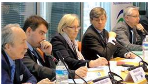
Panel of Integrating CO 2 in the Value Chain