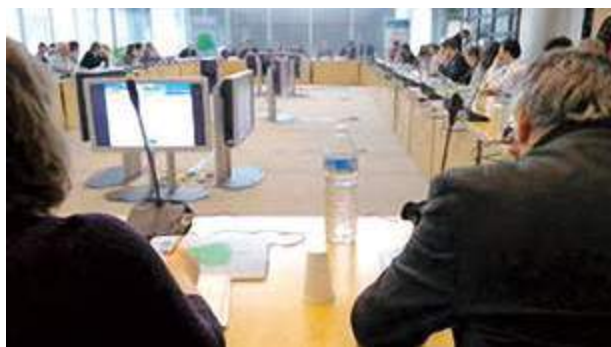
Audience at Integrating CO 2 in the Value Chain