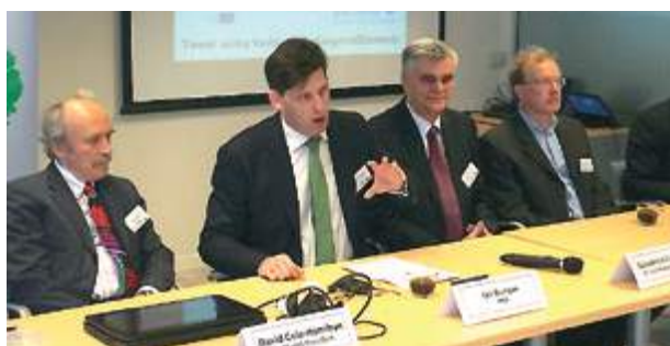
Speakers from Protecting Endangered Elements