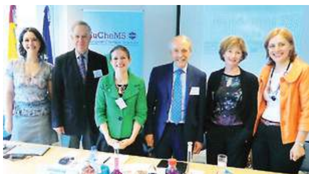
(Re)searching for Jobs Speakers